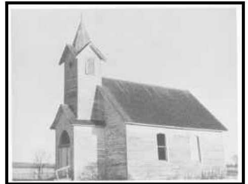
Eau Pleine Norwegian Evangelical Lutheran Church c. 1960's